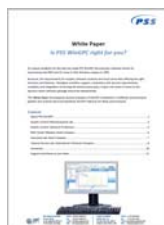
PSS White Paper: Is WinGPC right for me?