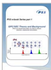
PSS e-book 1: GPC/SEC Theory and Background