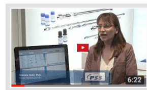
Video Interview Analytica 2018: PSS WinGPC MCDS

contact info@pss-polymer.com to receive free pdf copies