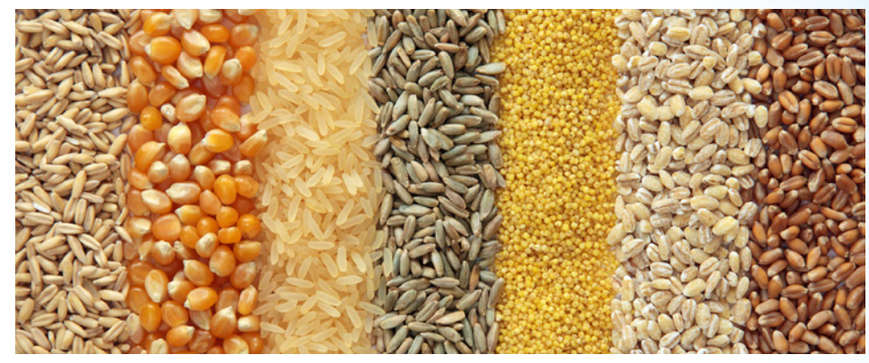
Some grains look very similar, and can be difficult to distinguish by eye.

Gluten is a protein composite found in wheat, rye and barley that gives dough its elastic and chewy texture. For people with severe gluten intolerance or celiac disease, even small amounts of gluten can cause debilitating bloating, abdominal pain and bowel dysfunction as well as fatigue and many adverse non-abdominal symptoms. Maintaining a gluten-free diet is challenging, as wheat derivatives are present in many processed foods like soy sauce and luncheon meats. With gluten-free products more widely available, the need for cost-effective and accurate validation of the grains used to make them has grown.