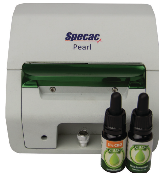
Specac's Liquid Transmission Accessory, The Pearl™ & CBD Cannabis Oil

A wide variety of cannabis derived products are now available for purchase, although the legality of these products varies from country to country. Within Europe, products containing more than 0.2% tetrahydrocannabinol (THC) are banned, however cannabidiol (CBD) containing products are legal. This note compares the FTIR spectra obtained from two such legal products.