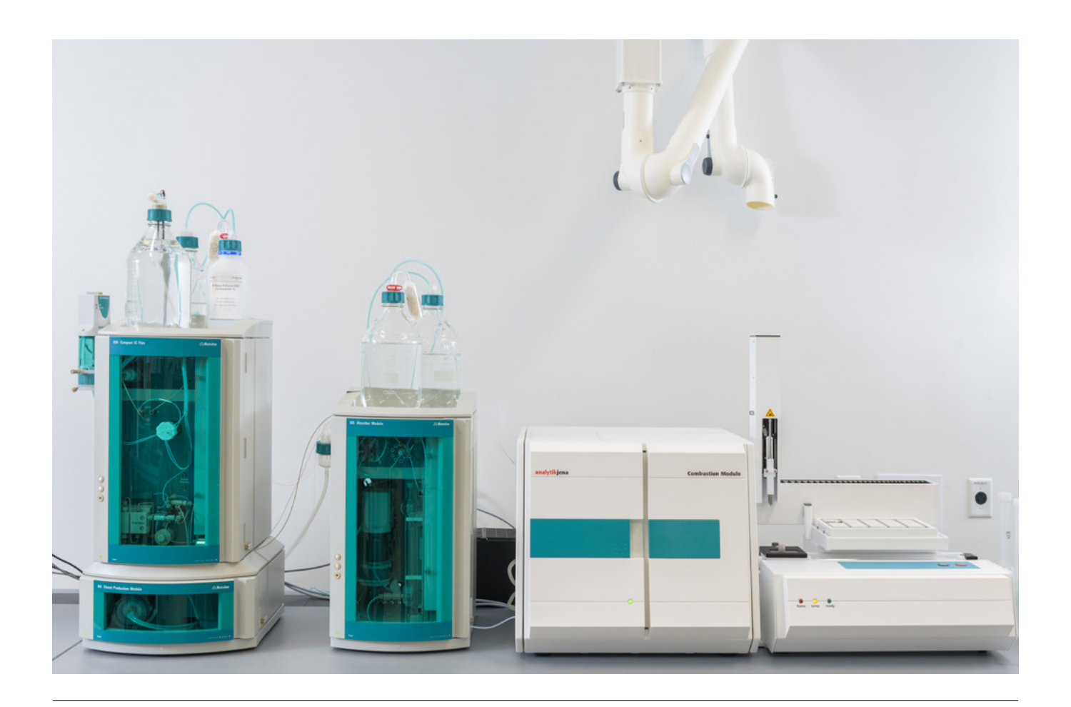
Figure 2. Profiler<sup>F</sup> Analyzer for AOF.

With increased concern over the environmental and health risks of PFAS compounds, accurate monitoring of these compounds is essential. The Profiler<sup>F</sup> Analyzer for AOF can reliably test non-targeted adsorbable organic fluorine (AOF) as per EPA Draft 1621. This can be done with increased sensitivity down to an MDL of 1.36 ppb, while demonstrating repeatability and accuracy to meet the proposed requirements of EPA Draft Method 1621.