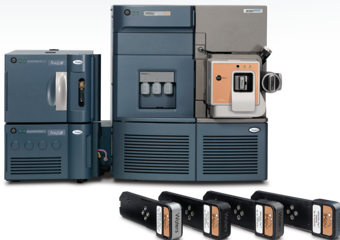
Figure 1. ionKey/MS System: comprised of the Xevo TQ-S, the ACQUITY UPLC M-Class, the ionKey source and the iKey separation device.

ionKey/MS: Enhanced MS with the turn of a Key. More sensitivity, more information from the same sample, more robust analysis. All with less solvent usage and less complexity to the user.