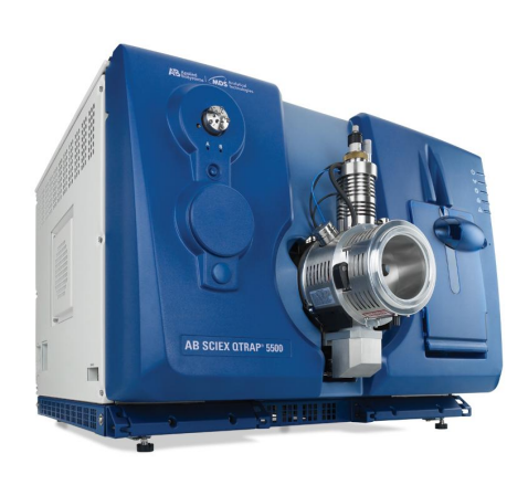
Figure 1. QTRAP® System technology enables identification, characterization, confirmation and quantitation of low abundance analytes.

A screening method was developed on the QTRAP® hybrid triple quadrupole linear ion trap system to take advantage of an MS2 spectral library that was generated from both the in vitro human liver microsomes and the positive human urine samples.